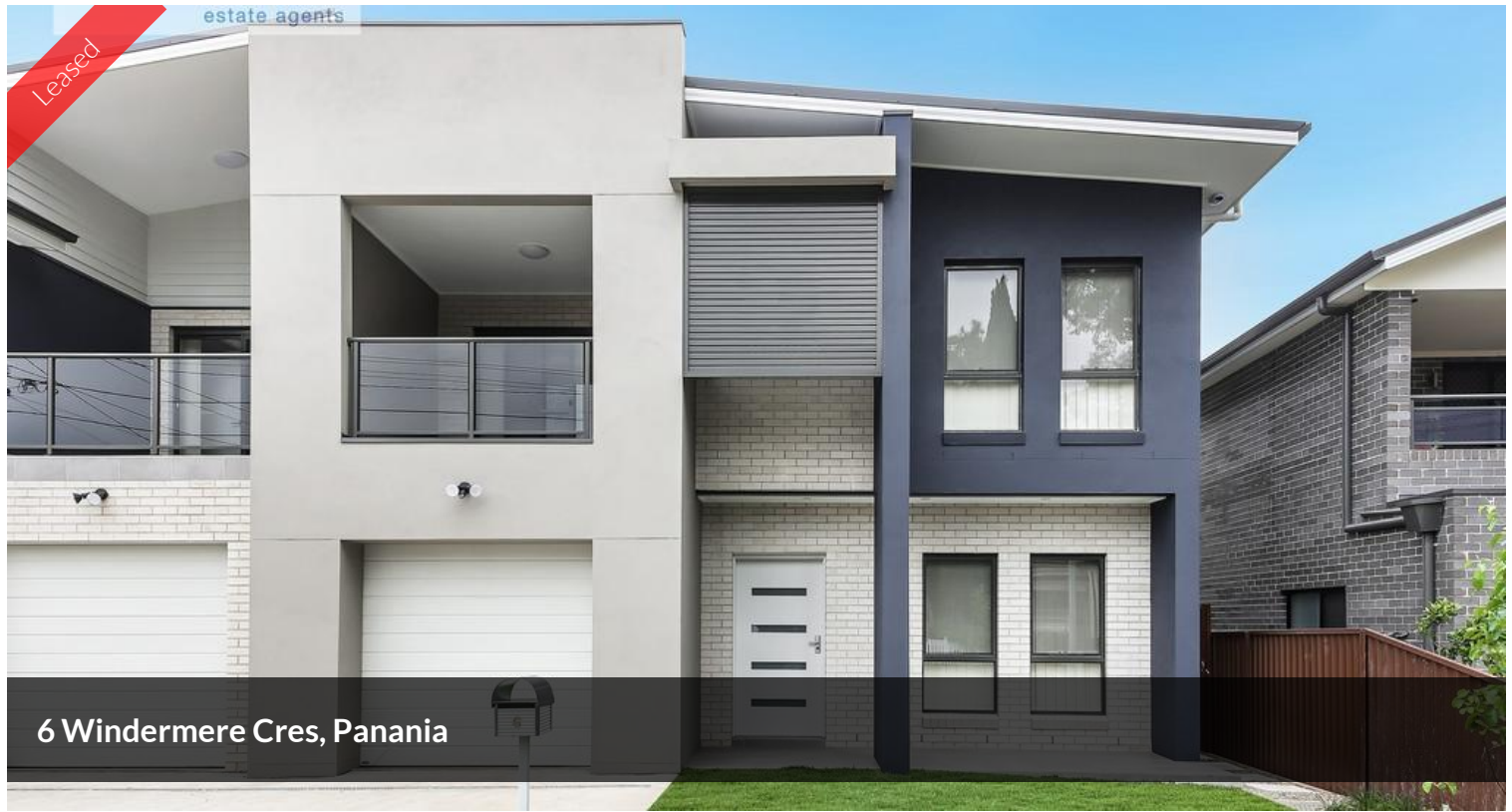
6 Windermere Cres, Panania