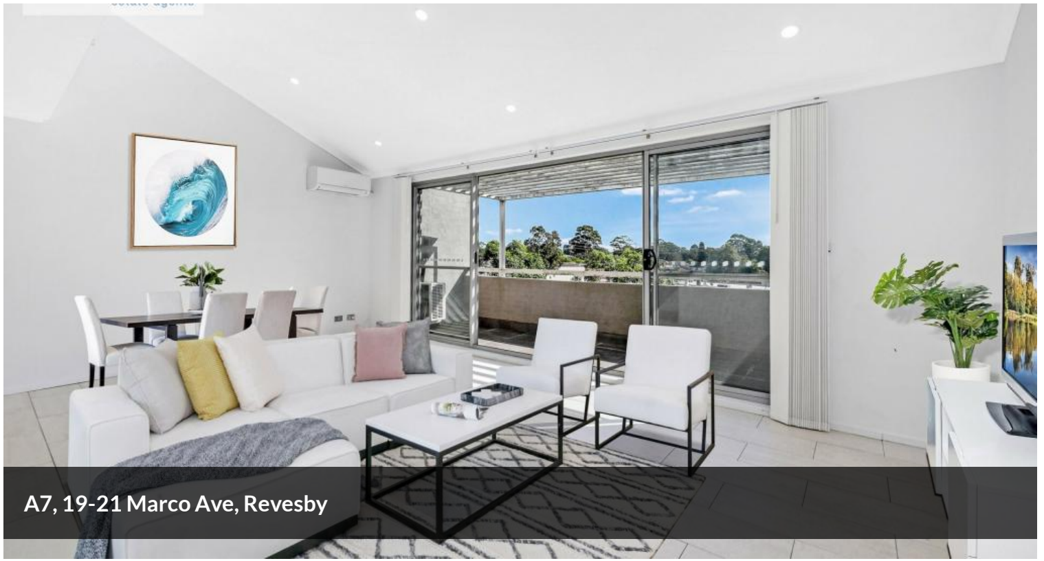
A7, 19-21 Marco Ave, Revesby