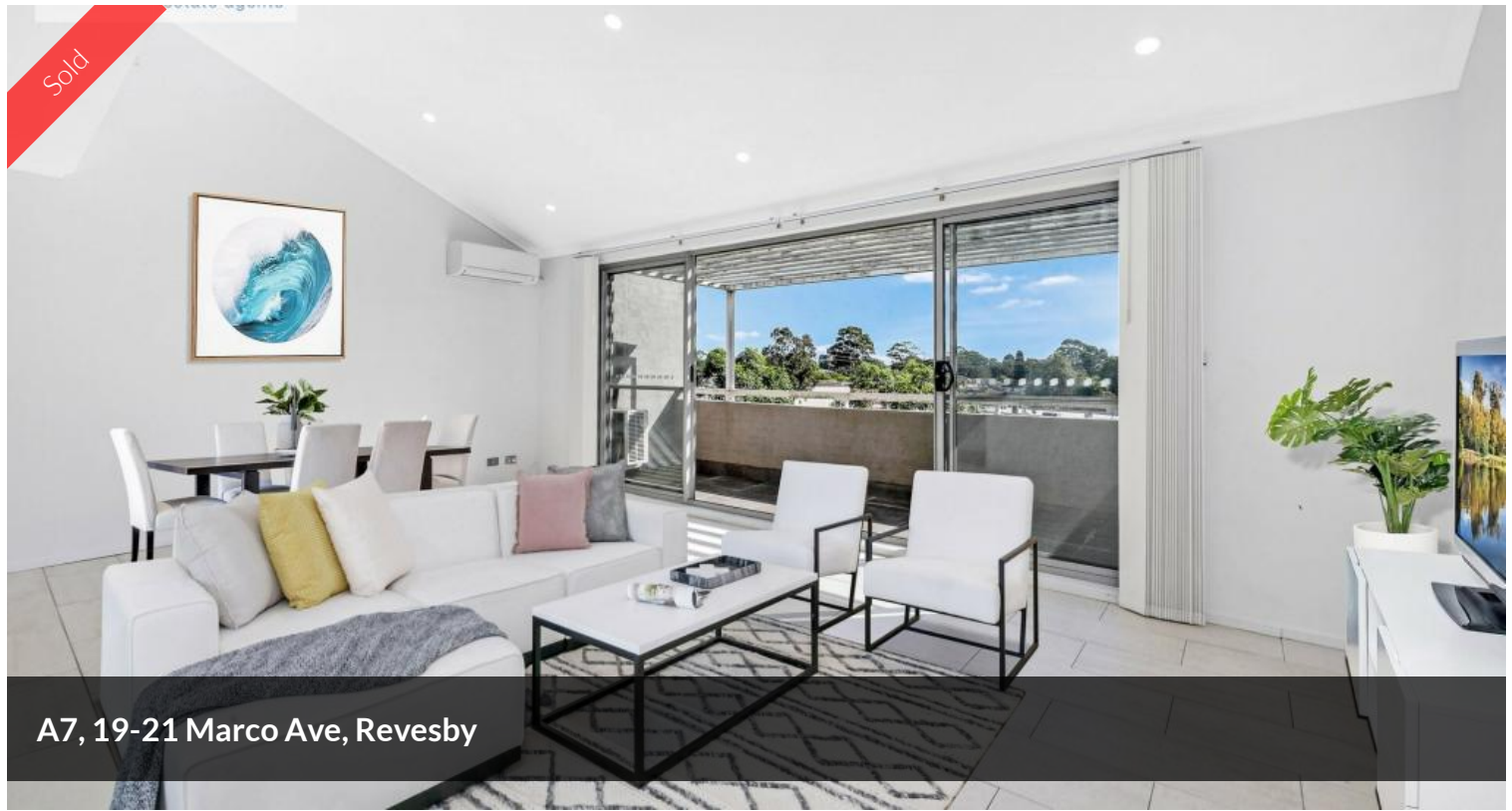
A7, 19-21 Marco Ave, Revesby