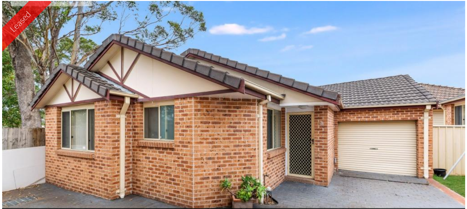
Unit 3, 200 Johnston Rd, Bass Hill