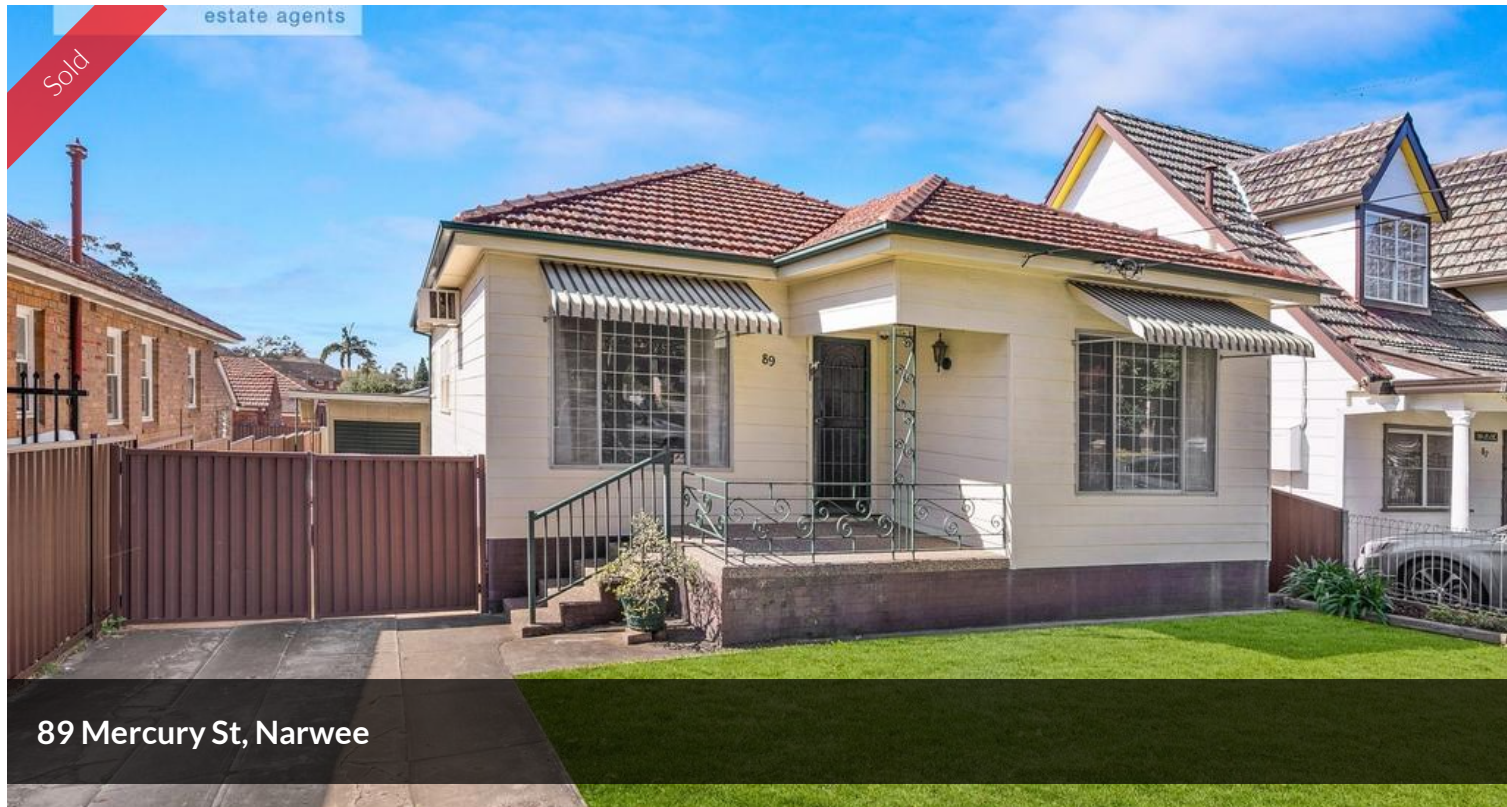
89 Mercury St, Narwee